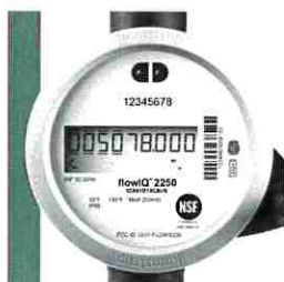
Kamstrup flowIQ® 2250

We have resolved many leak issues and saved customers many dollars.