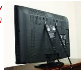
Flat-Panel TV (rear view)

Drop-off in store only during business hours.